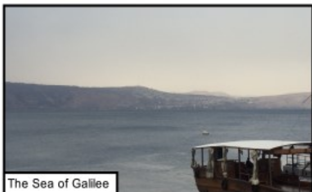
The Sea of Galilee