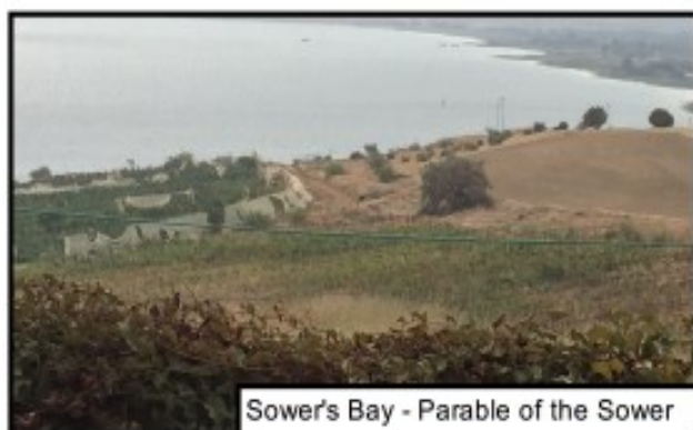
Sower's Bay - Parable of the Sower