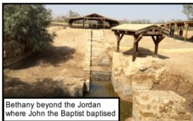
Bethany beyond the Jordan where John the Baptist baptised