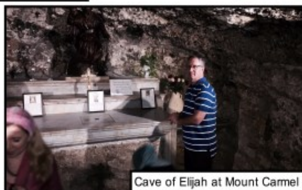
Cave of Elijah at Mount Carmel