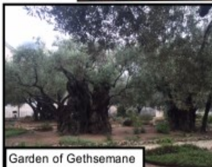
Garden of Gethsemane