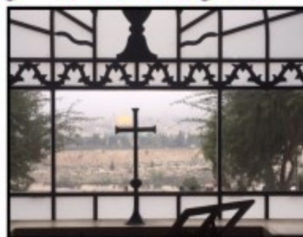
Church of Dominus Flevit, where Jesus wept over Jerusalem