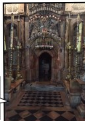
Tomb of Christ in the Holy Sepulchre