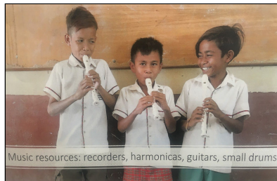
Music resources: recorders, harmonicas, guitars, small drums