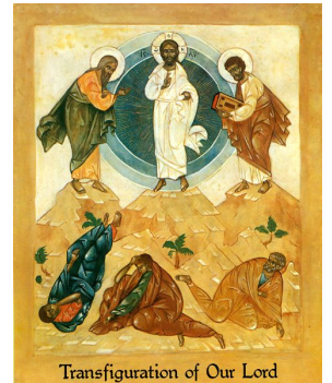
Transfiguration of Our Lord