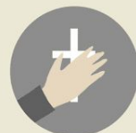
Fear of the Lord