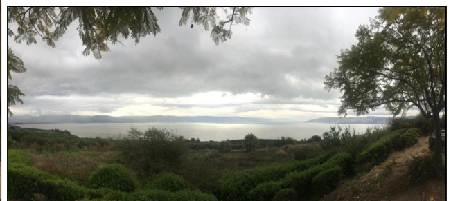
L-R: Fishing boats on the sea of Galilee - The Altar at the Church of the Multiplication of the Loaves and Fishes - View of The Sea of Galilee from the Mount of Beatitudes